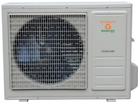
ODU (Outdoor Unit)

Variable Refrigerant Flow & Capacity means that the air conditioner is always the right size for the conditions and is never wasting power.