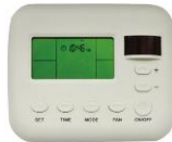
Wireless Wall Mount Controller